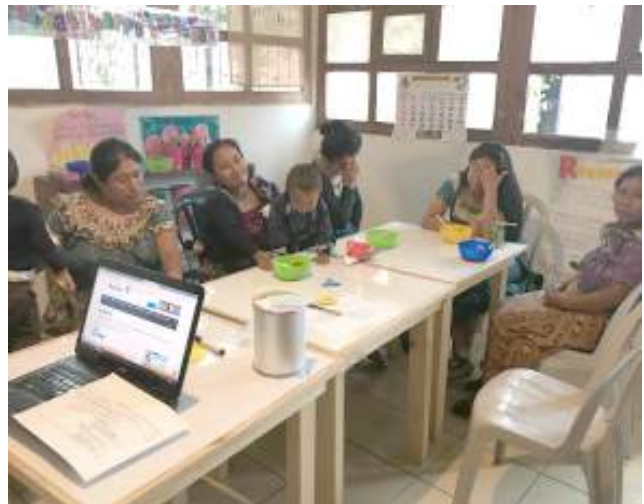
A Women in Action workshop