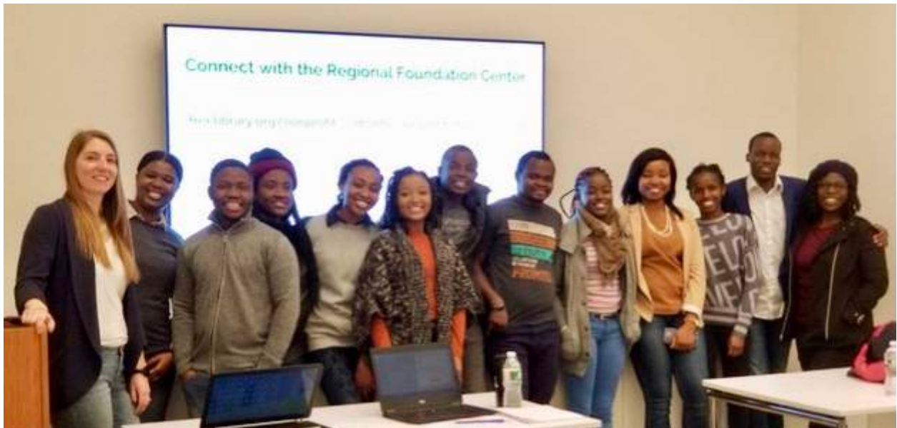
Urban Promise International Fellows | WIL Mentoring Program

Where additional in-person projects could not be delivered due to the pandemic, the Service Committee advocated for special WIL COVID grants to the following organizations: