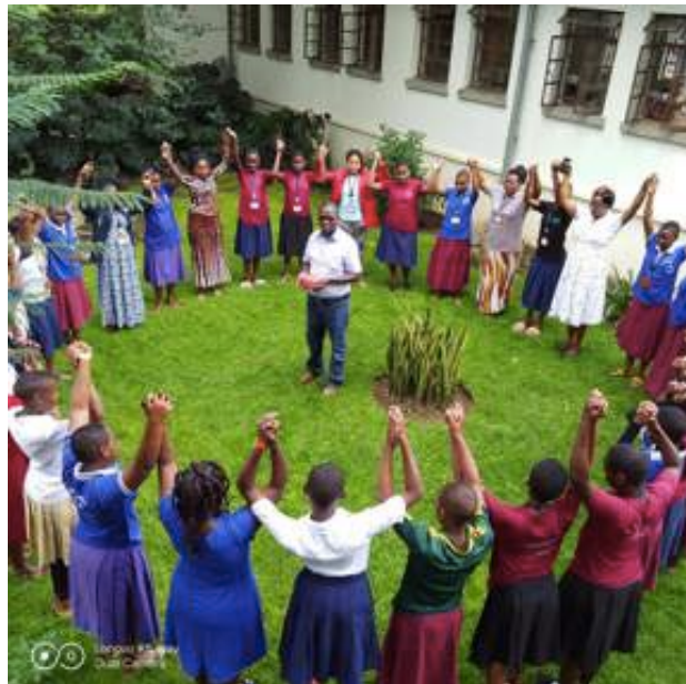
Mwangaza Education for Partnership

WIL philanthropy makes a difference in the lives of women and their families at Mwangaza Education for Partnership and Suenos