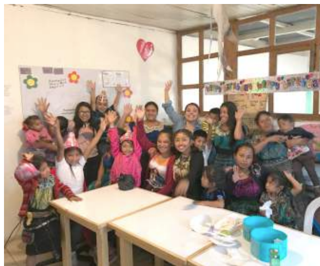
Mothers with their children participating in the Women in Action program

Women in Action is a program developed by Sueños (Asociación Sueños in Antigua Guatemala) in 2017. The program was started as a formal way to involve the mothers of Sueños’s after school program in their children’s education. An empowerment grant from WIL in 2019 allowed Sueños to expand the mothers’ program and include teen girls to drive them toward overcoming issues related to raising a family, health and wellbeing, violence in the home, and sexual health and education. All of the Women in Action participants work in the informal sector as street vendors, selling textiles, candies or lottery tickets in the Central Park of Antigua Guatemala.