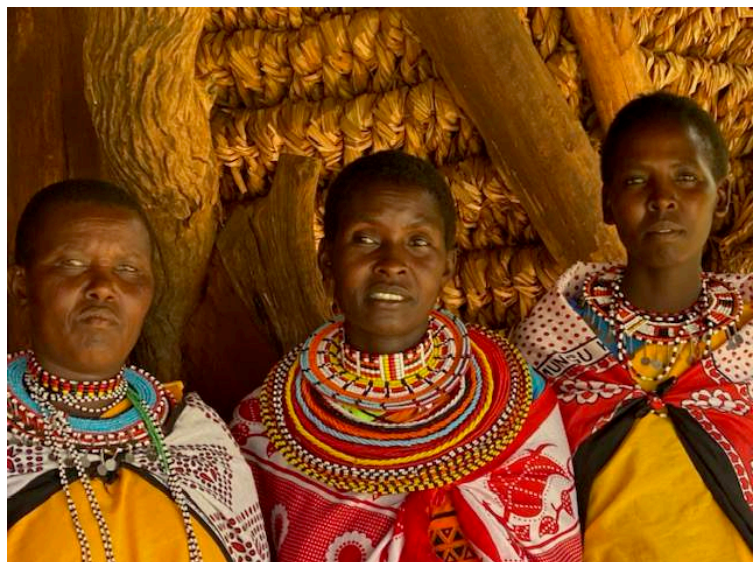
WIL Kenya trip | February 2020